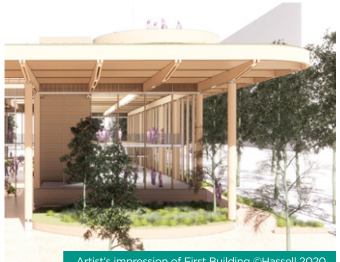
Artist's impression of First Building ©Hassell 2020

We will work with representatives of the local Aboriginal community and with Liverpool City Council to give the first building in the Bradfield City Centre a First Nations name. We will also work with cultural leaders, the community and council to help identify a range of suitable names for other Bradfield City Centre features to reflect and honour our multicultural communities as well as the people and achievements of the past that have helped to shape the Western Parkland City.