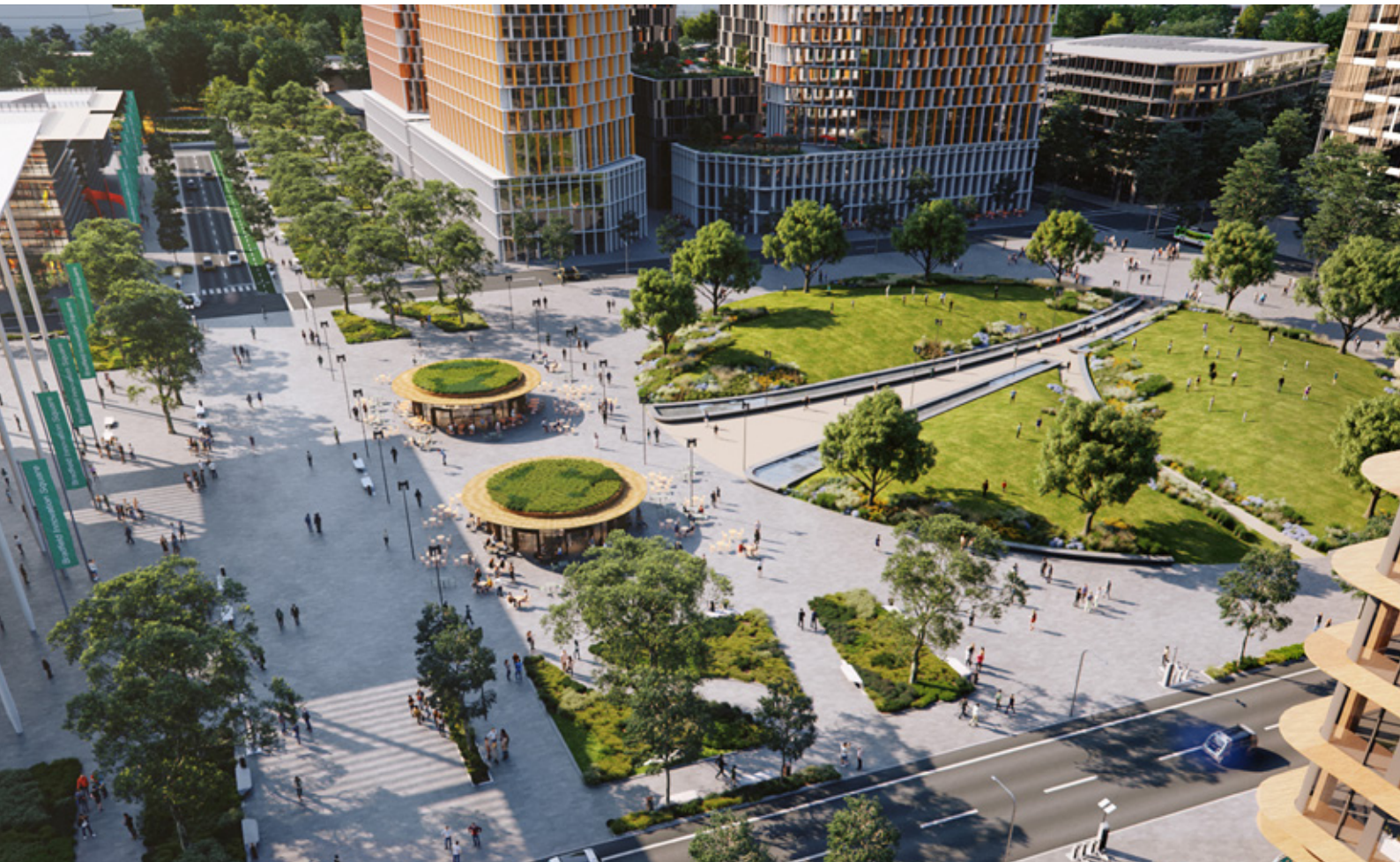
Bradfield City Centre - Artist's Impression only